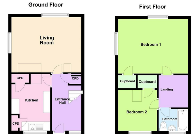
This plan is for illustrative and guidance purposes only and should be used as such by any prospective purchaser. Whilst every attempt has been made to ensure the accuracy of this floor plan all measurements of rooms, windows, doors and any other items are approximate and no responsibility is taken by the Agent for any errors, omissions or misrepresentation. Plan produced using PlanUp.

Both the Marketing Agent and The Auctioneer may believe necessary or beneficial to the customer to pass your details to third party service suppliers, from which a referral fee may be obtained. There is no requirement or indeed obligation to use these recommended suppliers or services.