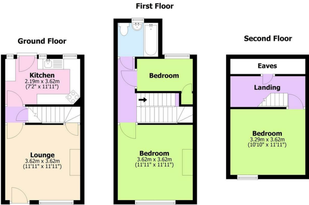
This plan is for illustrative and guidance purposes only and should be used as such by any prospective purchaser. Whilst every attempt has been made to ensure the accuracy of this floor plan all measurements of rooms, windows, doors and any other items are approximate and no responsibility is taken by the Agent for any errors, omissions or misrepresentation. Plan produced using PlanUp.