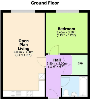
This plan is for illustrative and guidance purposes only and should be used as such by any prospective purchaser. Whilst every attempt has been made to ensure the accuracy of this floor plan all measurements of rooms, windows, doors and any other items are approximate and no responsibility is taken by the Agent for any errors, omissions or misrepresentation. Plan produced using PlanUp.