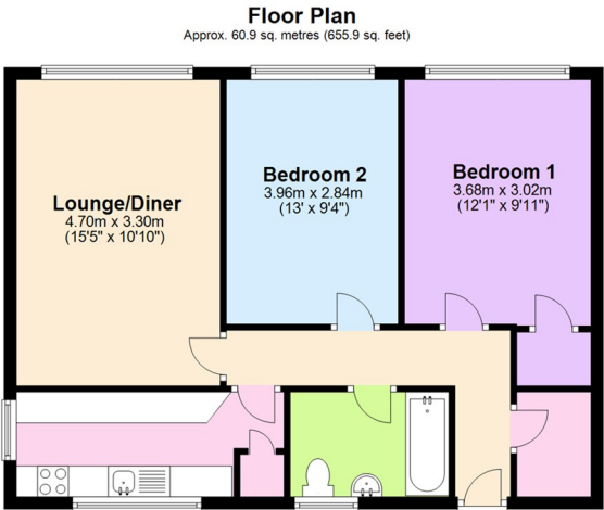
Total area: approx. 60.9 sq. metres (655.9 sq. feet) This plan is for illustrative and guidance purposes only and should be used as such by any prospective purchaser. Whilst every attempt has been made to ensure the accuracy of this floor plan all measurements of rooms, windows, doors and any other items are approximate and no responsibility is taken by the Agent for any errors, omissions or misrepresentation. Plan produced using PlanUp.

Agent Notes 1. Anti-Money Laundering (AML) Regulations – All named purchasers and anyone gifting funds will be asked to produce identification documentation before proceeding to instruction of solicitors and we would ask for your co-operation in order to proceed to agreeing the sale as soon as possible. 2. Source of Funds - All named purchasers and anyone gifting funds will be asked to produce evidence of the source of their funds before proceeding to instruction of solicitors. 3. These particulars do not constitute part or all of an offer or contract. 4. Any measurements indicated are intended for guidance only and as such must not be relied upon and any interested parties are advised to confirm any measurements before committing to any offer. 5. Archer Bassett has not tested any equipment, appliances, fixtures, fittings or services.