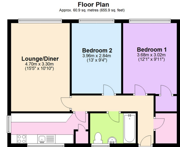
Total area: approx. 60.9 sq. metres (655.9 sq. feet)

Viewings are strictly by appointment only via Archer Bassett.