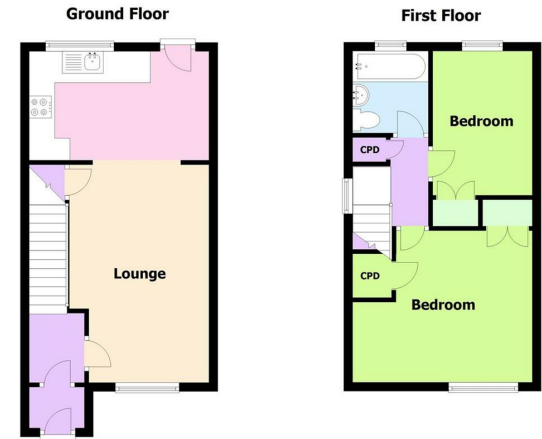
This plan is for illustrative and guidance purposes only and should be used as such by any prospective purchaser. Whilst every attempt has been made to ensure the accuracy of this floor plan all measurements of rooms, windows, doors and any other items are approximate and no responsibility is taken by the Agent for any errors, omissions or misrepresentation. Plan produced using Planip.

Viewings are strictly by appointment only via Archer Bassett.