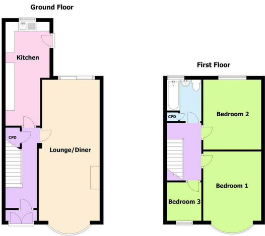
This plan is for illustrative and guidance purposes only and should be used as such by any prospective purchaser. Whilst every attempt has been made to ensure the accuracy of this floor plan all measurements of rooms, windows, doors and any other items are approximate and no responsibility is taken by the Agent for any errors, omissions or misrepresentation. Plan produced using PlanIt.

Viewings are strictly by appointment only via Archer Bassett.