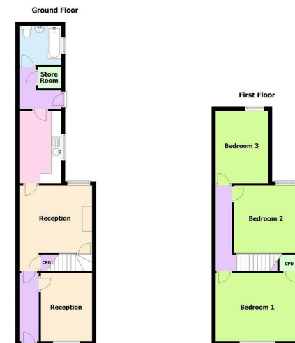
This plan is for illustrative and guidance purposes only and should be used as such by any prospective purchaser. Whilst every effort has been made to ensure the accuracy of this floor plan all measurements of rooms, windows, doors and any other items are approximate and no responsibility is taken by the Agent for any errors, omissions or misrepresentation. Plan prepared using Planity.

Viewings are strictly by appointment only via Archer Bassett.