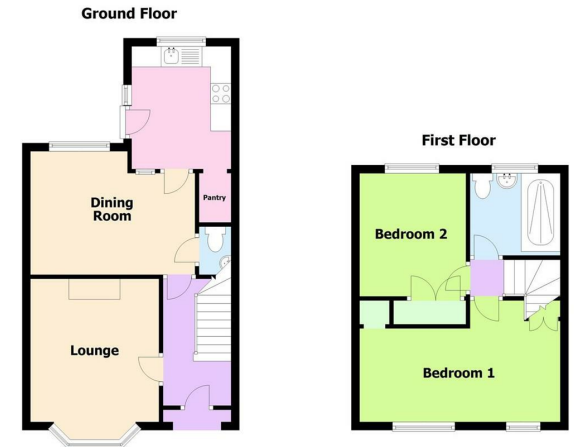
This plan is for illustrative and guidance purposes only and should be used as such by any prospective purchaser. Whilst every attempt has been made to ensure the accuracy of this floor plan all measurements of rooms, windows, doors and any other items are approximate and no responsibility is taken by the Agent for any errors, omissions or misrepresentation. Plan produced using PlanUp.

Viewings are strictly by appointment only via Archer Bassett.