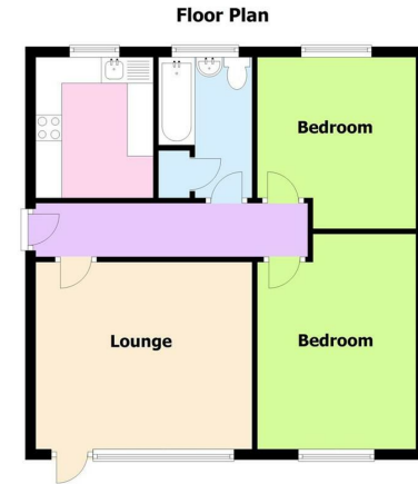
This plan is for illustrative and guidance purposes only and should be used as such by any prospective purchaser. Whilst every attempt has been made to ensure the accuracy of this floor plan all measurements of rooms, windows, doors and any other items are approximate and no responsibility is taken by the Agent for any errors, omissions or misrepresentation. Plan produced using PlanItUp.

Viewings are strictly by appointment only via Archer Bassett.