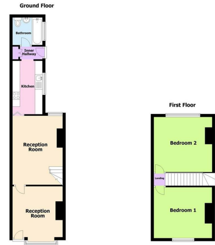
This plan is for illustrative and guidance purposes only and should be used as such by any prospective purchaser. Whilst every attempt has been made to ensure the accuracy of this floor plan all measurements of rooms, windows, doors and any other items are approximate and no responsibility is taken by the Agent for any errors, omissions or misrepresentation. Plan produced using Floorplan.

Viewings are strictly by appointment only via Archer Bassett.