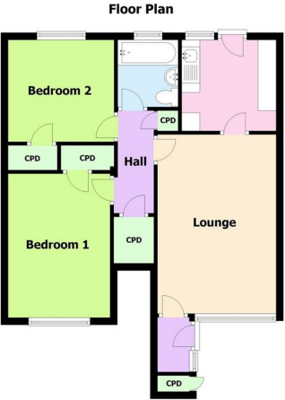
This plan is for illustrative and guidance purposes only and should be used as such by any prospective purchaser. Whilst every attempt has been made to ensure the accuracy of this floor plan all measurements of rooms, windows, doors and any other items are approximate and no responsibility is taken by the Agent for any errors, omissions or misrepresentation. Plan produced using PlanUp.

Viewings are strictly by appointment only via Archer Bassett.